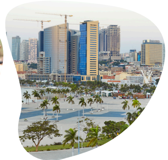
Birthplace of kizomba, semba, and kuduro