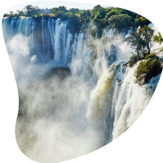
Waterfalls, desert, ocean, national parks