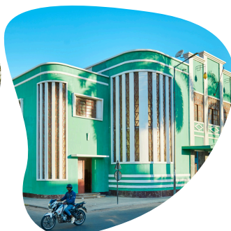
History, cities, nightlife