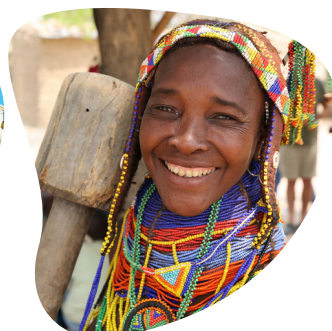
100+ ethnic groups